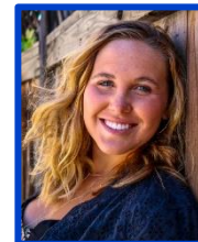
Eva Ratcliffe Social Media

We appreciate your interest in Clear Blue Sea —the Ocean needs more fans like you! Follow us on Facebook , Instagram , & Twitter @ClearBlueSeaOrg and keep in touch by emailing us directly: susanb@clearblueseas.org and jgottdank@clearblueseas.org or visit www.ClearBlueSea.org